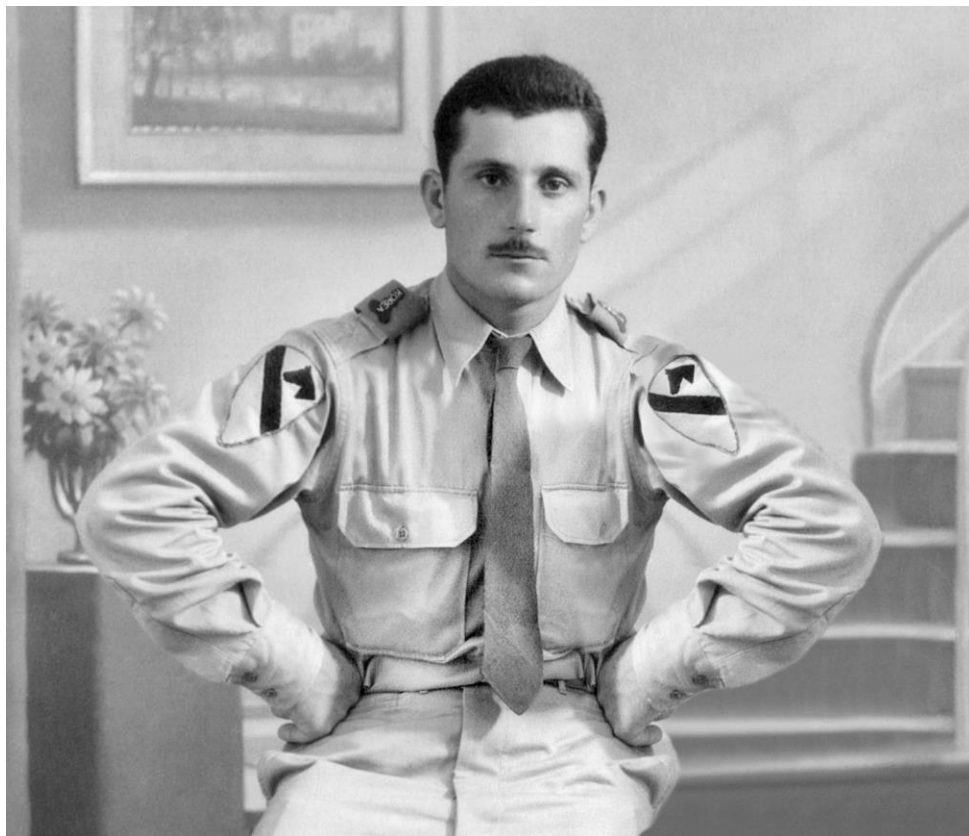
Does anyone recognise this Soldier? ..... The answer is on page 4